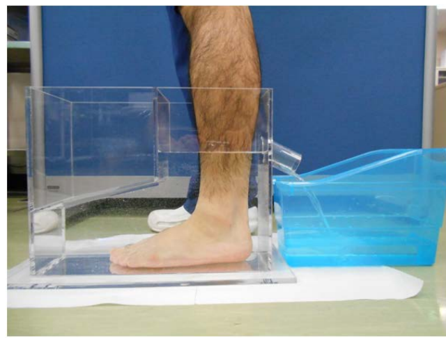
Figure 2: Measurement of Foot and Ankle. Measurement of Foot and Ankle by Water-Filled Volumetric Edema Gauge.

Eighty-five measurements of the VAS out of 110 sessions of HBO 2 therapy were fully recorded and were used for analysis in this study. The VAS evaluation included questions about pain at rest, pain while walking and a subjective evaluation of edema. The VAS consisted of a maximum of 100 points at full mark, where 100 points indicates the worst condition and 0 points indicates no complaint.